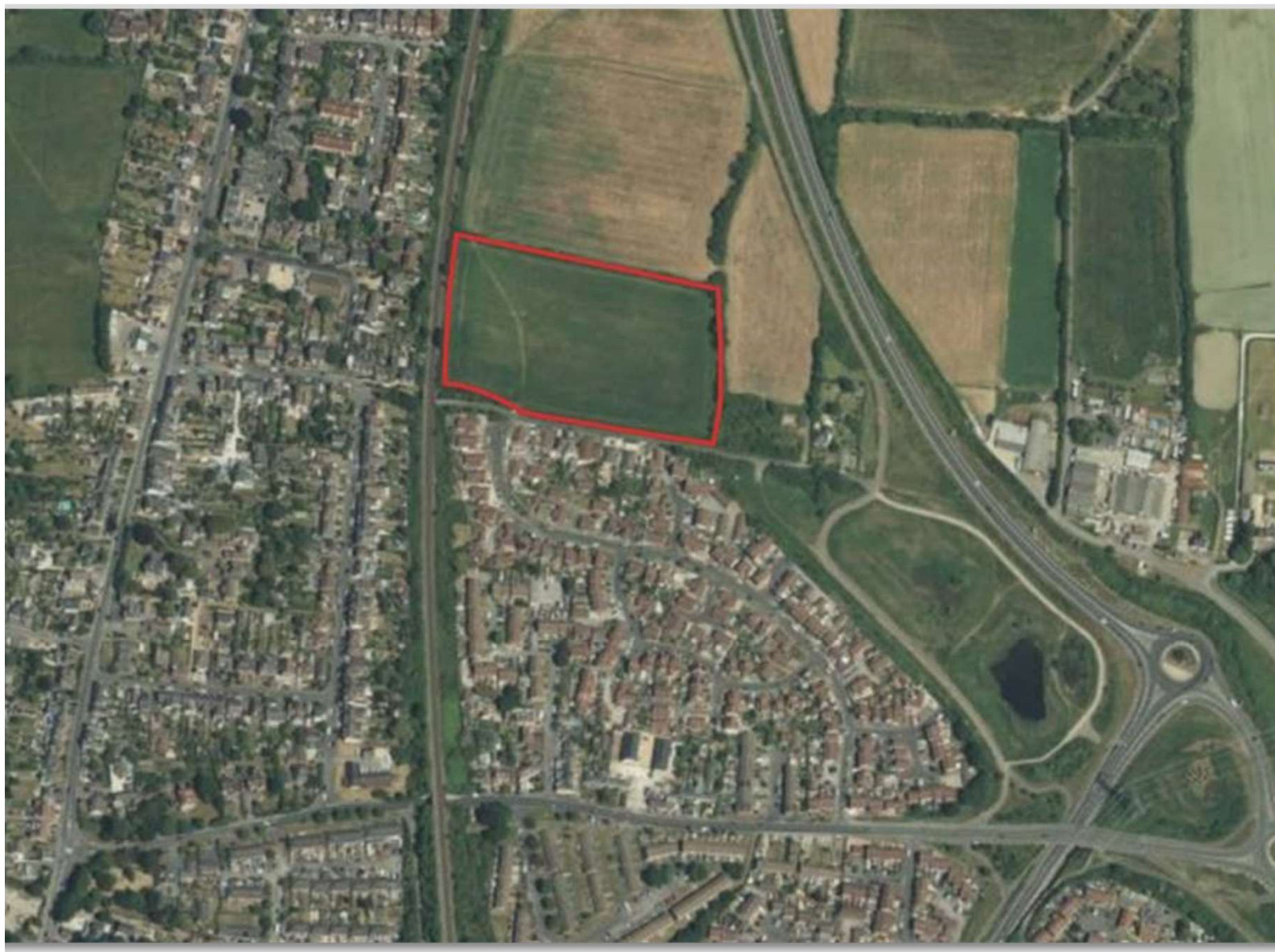
Land at Icen Lane, Upwey