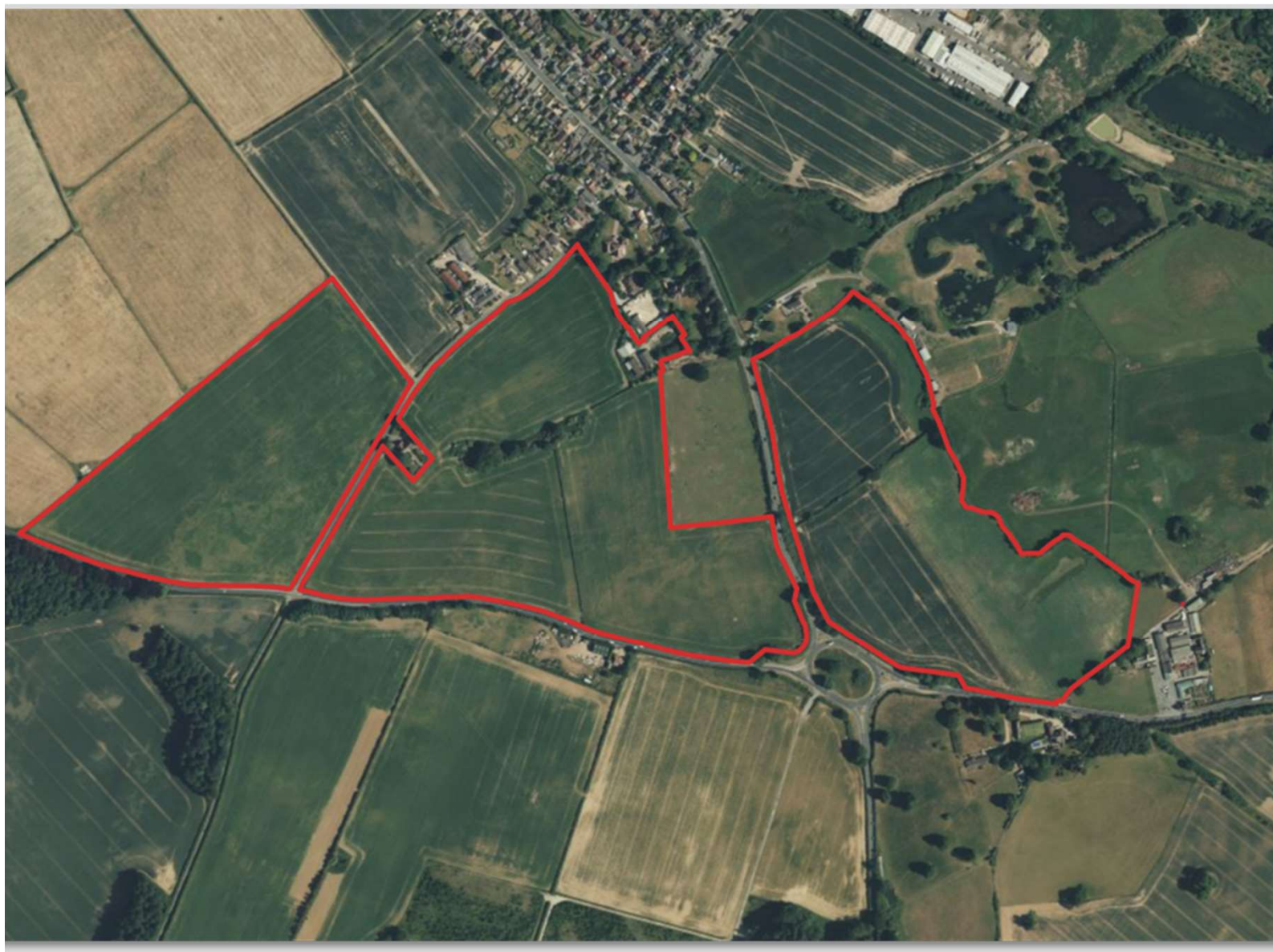
Land at Sturminster Marshall, Wimborne