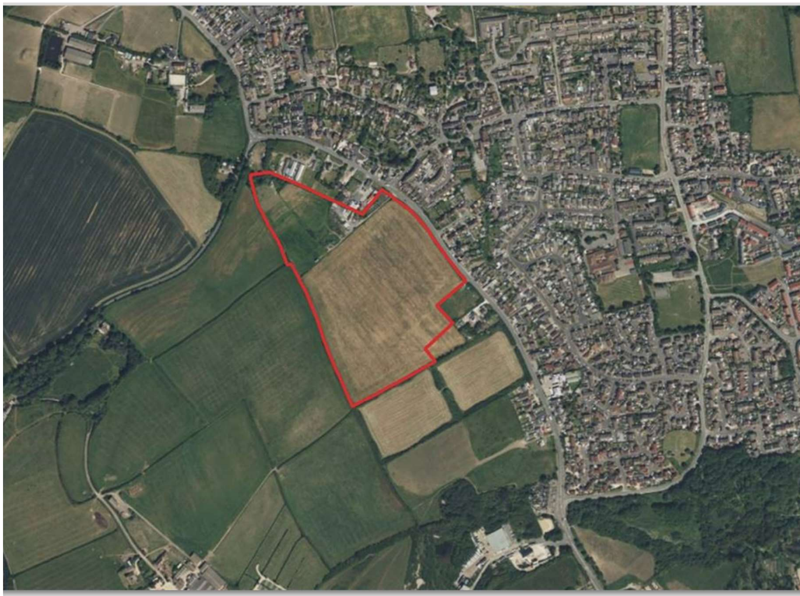
Land at Chickerell, Weymouth