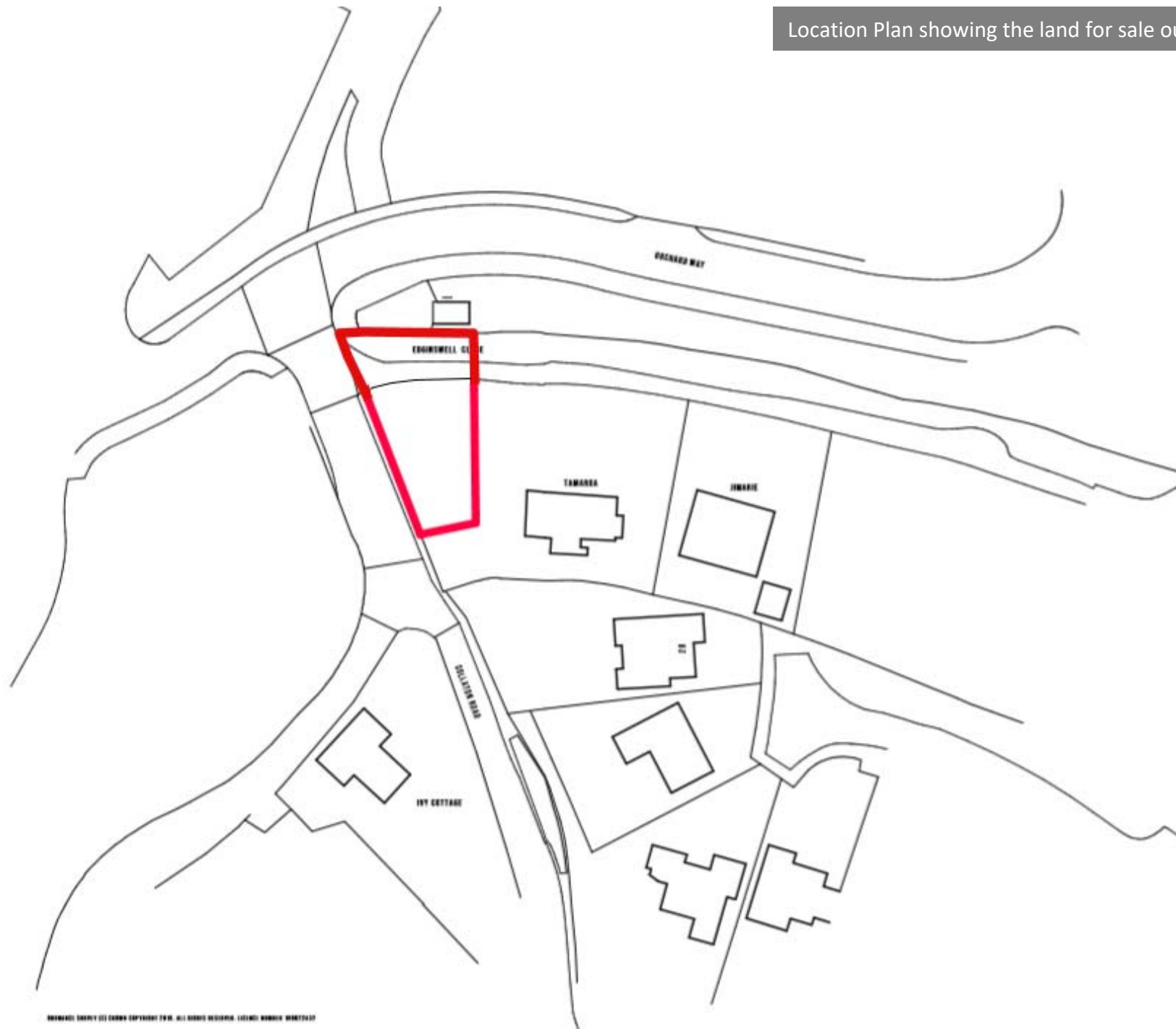
Location Plan showing the land for sale outlined in red