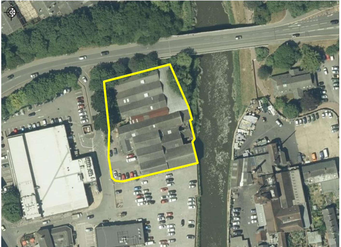
Site boundary for indicative purposes only