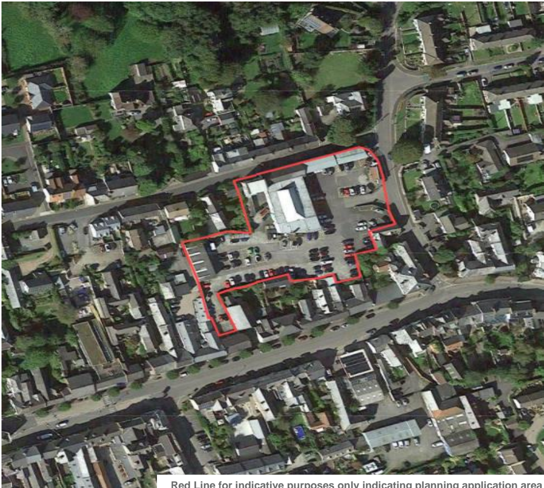
Red Line for indicative purposes only indicating planning application area